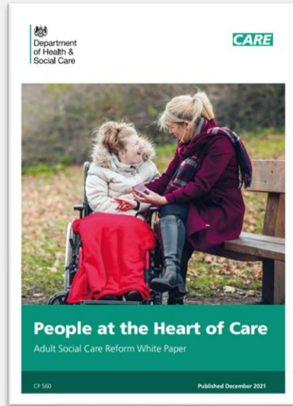
People at the Heart of Care