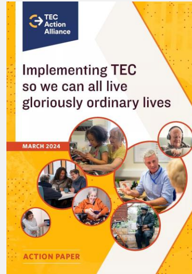
Implementing TEC so we can all live gloriously ordinary lives