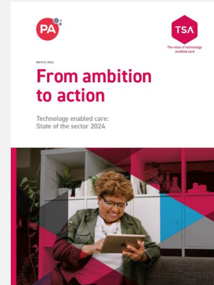
TEC: State of the Sector